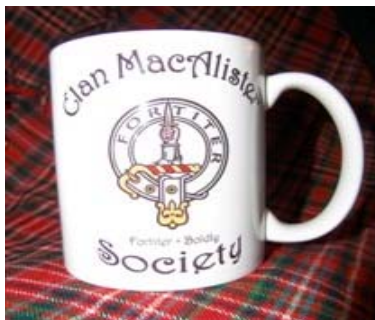
Our New Coffee Mug

Send completed Merchandise Order and Check to: